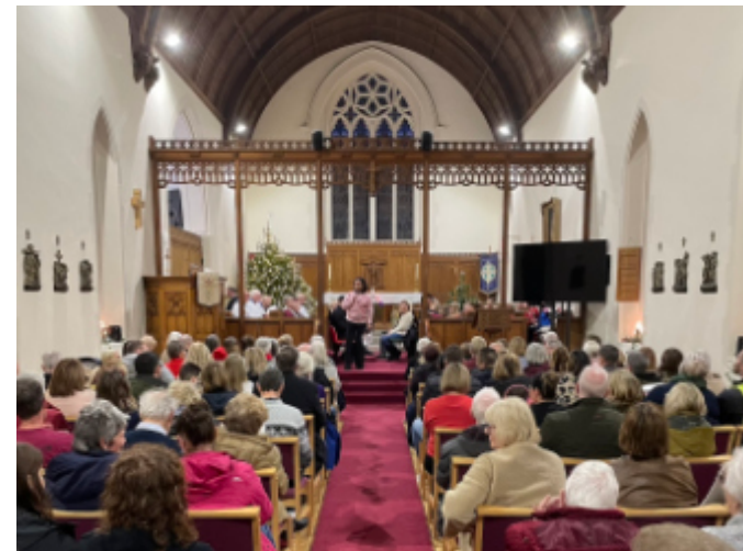
House Full at St Hilary's Church Carol Service.... no room in the Inn....