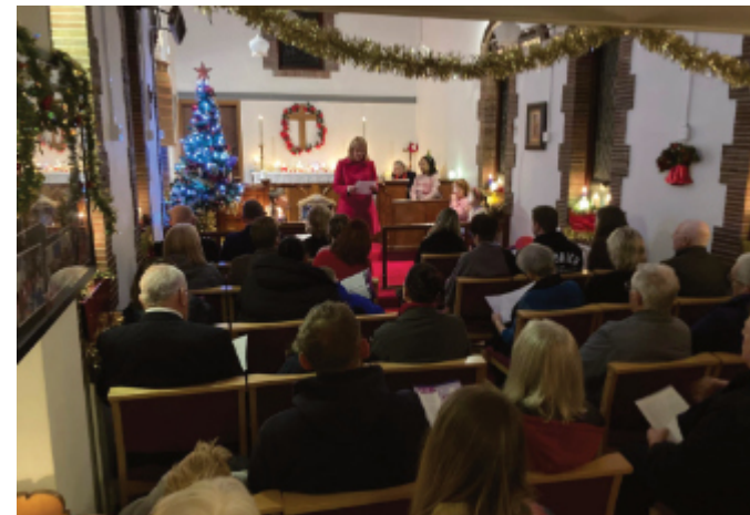
6th Annual Community Candlelight Carol Service at St Martin's Church