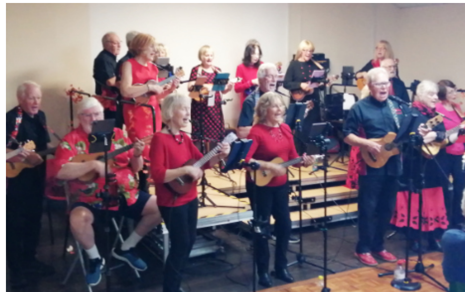
Swansea U3A Ukulele big band at the Harvest Supper at St Hilary's Church Hall